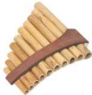
FLUTE DE PAN