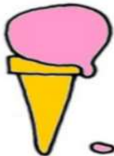
an ice cream cone