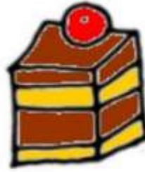
a chocolate cake