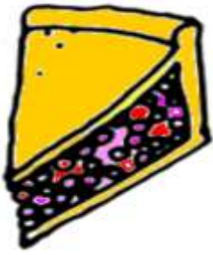
a cherry pie